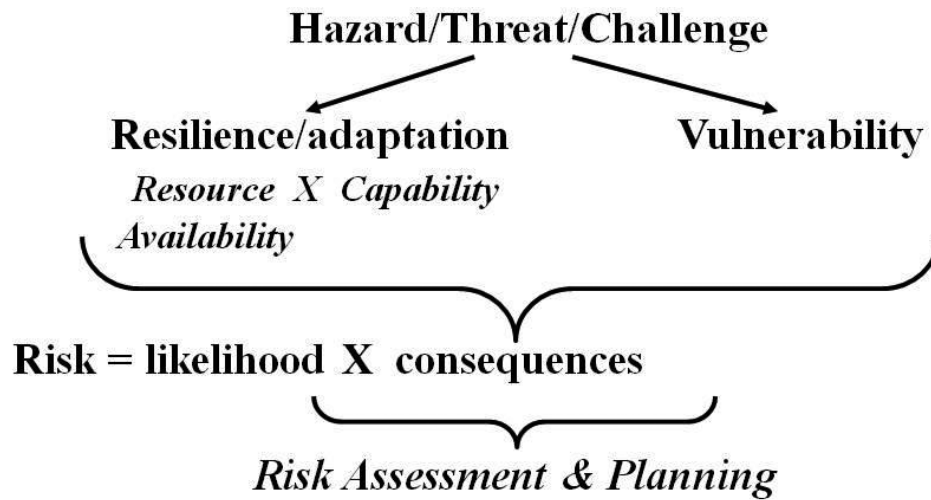
Figure 1.1. The relationship between risk and resilience.

timing, nature, duration, or location of the events they are called on to respond to. However, emergency and helping professions agencies can make choices about the consequences their members experience as a result of experiencing a hazardous or critical incident (Paton, Violanti, Burke, & Gherke, 2009).