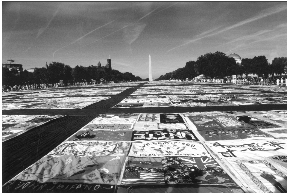
Figure 1-1. "The AIDS Quilt on the Mall in Washington, D.C. and the Washington Monument. The AIDS Memorial Quilt