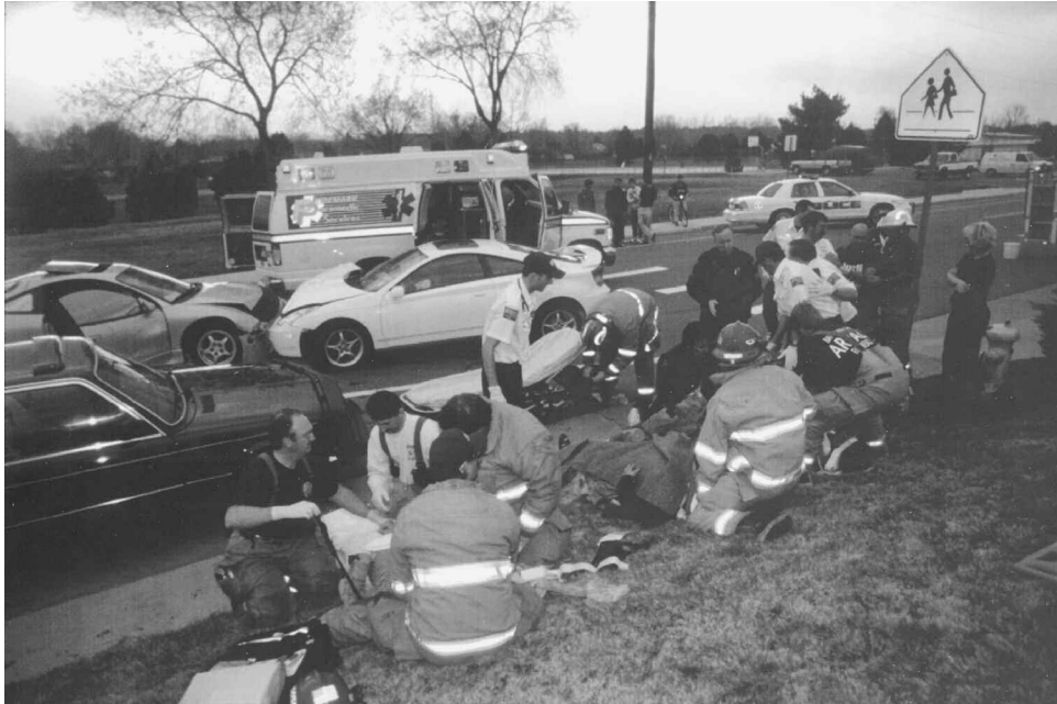
EMS and law enforcement act together at a major accident scene.