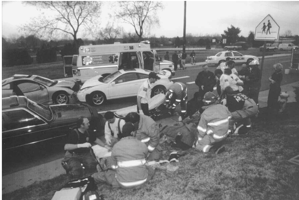
EMS and law enforcement act together at a major accident scene.