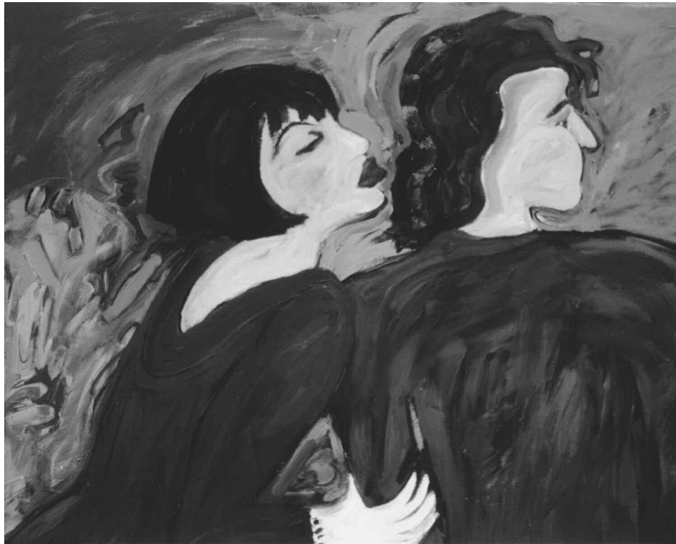
Figure 1. The image has life.

The notion that an image has a life of its own and its own stories to tell can be demonstrated at an art exhibit. If the viewers of any piece are asked to tell the story of the work, it is intriguing what will emerge! No two stories are exactly the same.